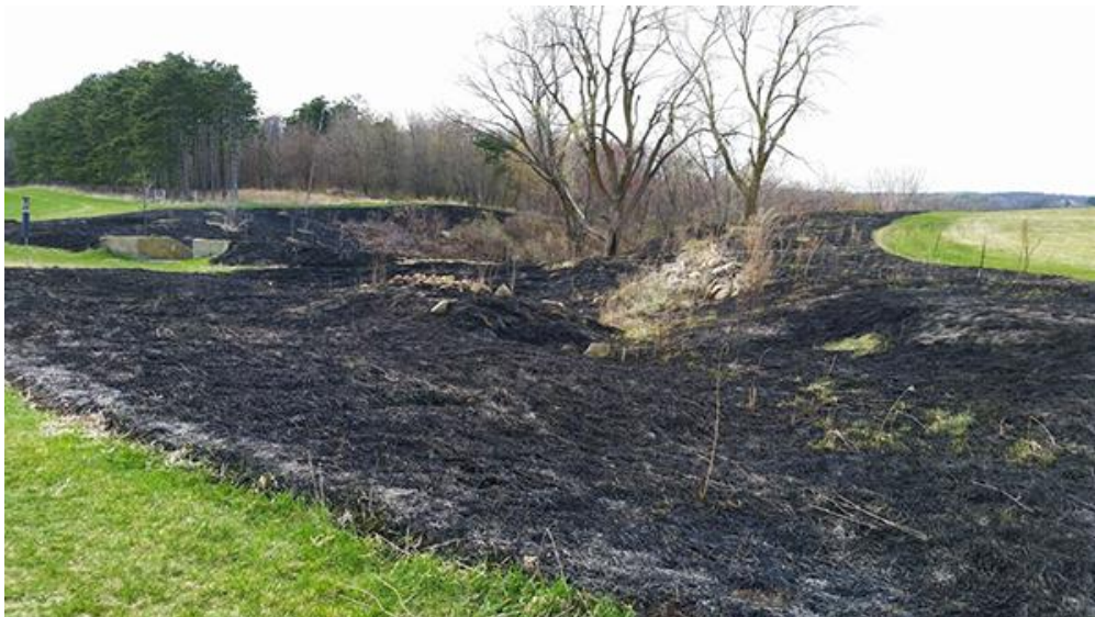
Above: The Ravine Prairie Burn

During the first week in April, four different prairies at PFC were burned. The next day it snowed, so we took advantage of the spring-like weather. The Blackhawk Prairie and the Ravine were then burned on April 17th once the prairies had a chance to dry out a bit.