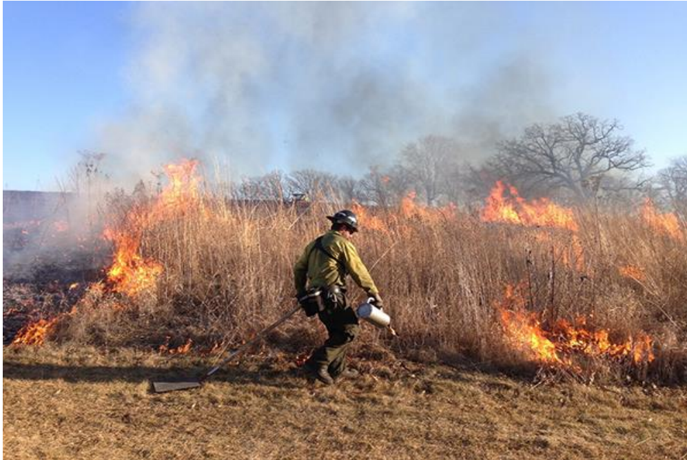
Pictured Above: Hillside Oak Savannah Burn (center part of the Conservancy)

During the first week in April, four different prairies at PFC were burned. The next day it snowed, so we took advantage of the spring-like weather. The Blackhawk Prairie and the Ravine were then burned on April 17th once the prairies had a chance to dry out a bit.