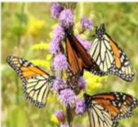
Meadow Blazing Star (with Monarch Butterflies)