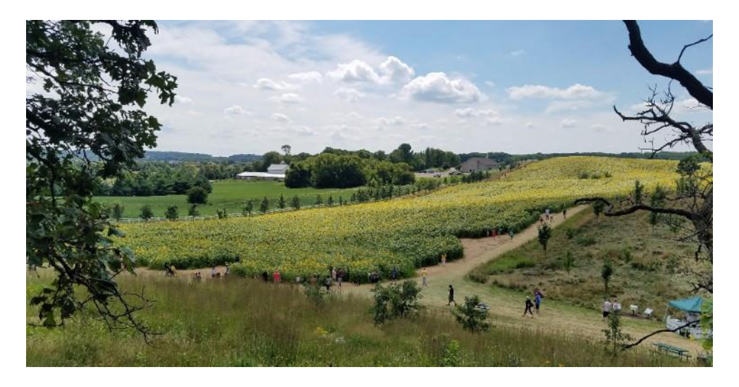
All three local TV stations jumped on the band wagon, and the people came in droves.