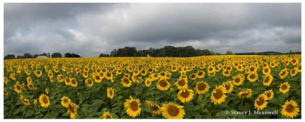
And a happy field of Sunflowers to you, Volunteers!

(If we have missed anyone on this list, we sincerely apologize)