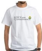
FOPFC Men's T-Shirt $18.39