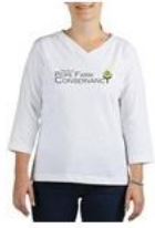
FOPFC Women's 3/4 Sleeve T-Shirt $28.19