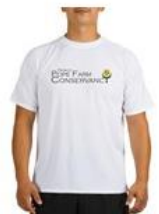
FOPFC Performance Dry T-Shirt $34.49