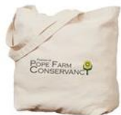
FOPFC Tote Bag $14.49