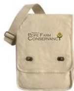
FOPFC Field Bag $25.29