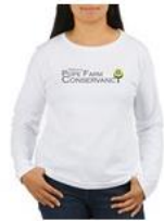
FOPFC Women's Long Sleeve T-Shirt $24.09