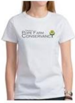
FOPFC Women's T-Shirt $19.49