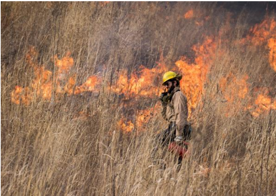
Controlled prairie burn at PFC.