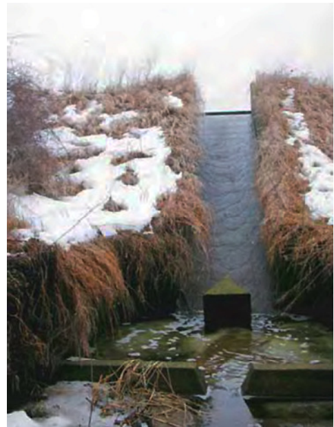
Picture Below: Water flows toward the spillway in ever increasing amounts and velocity!

For those who frequently walk Pope Farm Conservancy, you will no doubt remember the CCC spillway. This structure was built in the 1930's by the Civilian Conservation Corp to prevent the hillside from eroding away, and in turn, saving the farm fields above it. It is quite unusual for people to see this spillway in action because it can sit dormant for 20 years at a time, but when it is working, it is a sight worth seeing. There are several key conditions that are usually present for large amounts of water to reach the spillway. First, the ground is frozen - we certainly have that present this year! Second, there is usually a large amount of snow on the north facing fields above the spillway - we have that condition, as well. Finally, we need a burst of warm temperatures. When that happens, usually in the late afternoon, the hills literally begin to flow. Another condition to cause this type of flow is a heavy rain while the ground is still frozen.