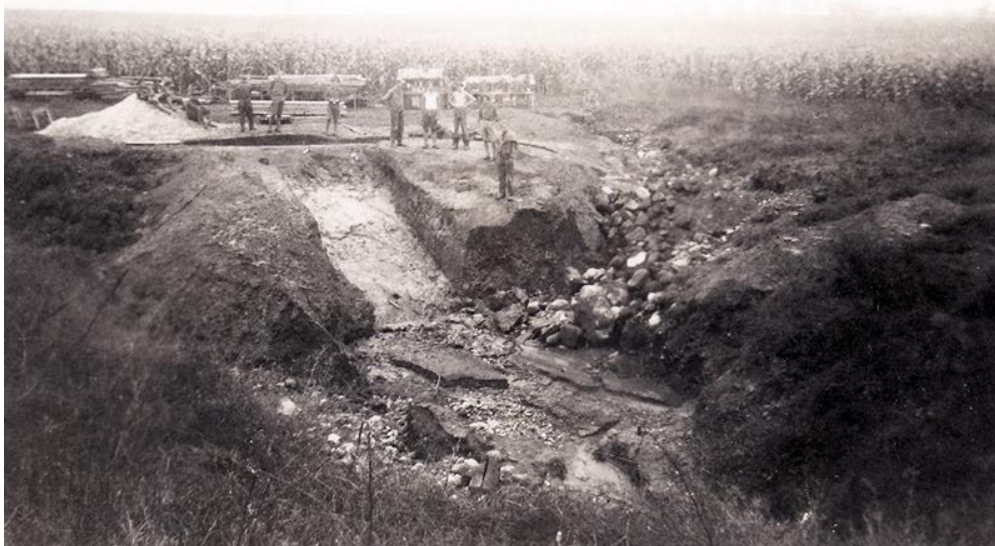
Pictured Above: Spillway under construction in 1938 (before the conservancy)

Are there any new interpretive signs going up this season?