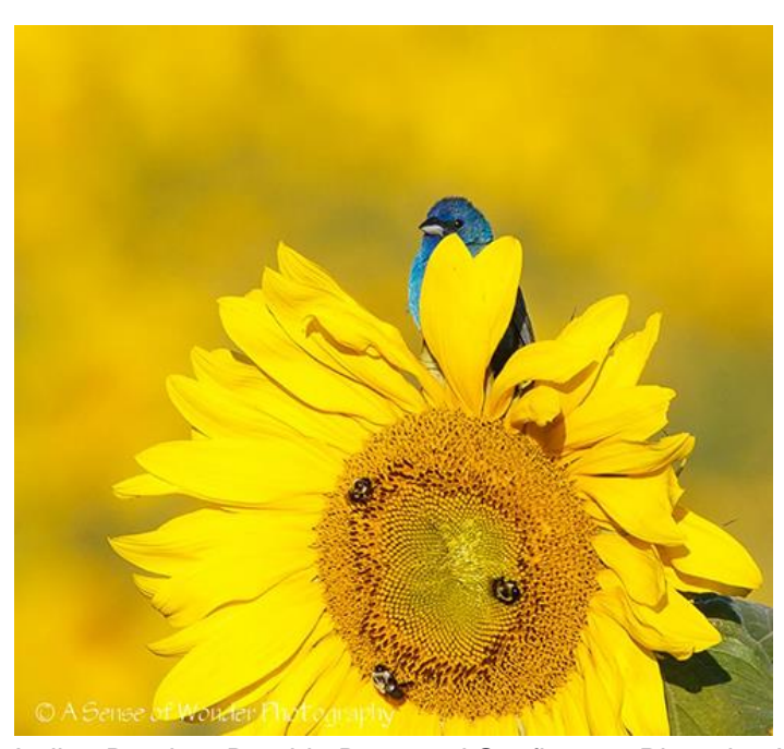
Indigo Bunting, Bumble Bees and Sunflower