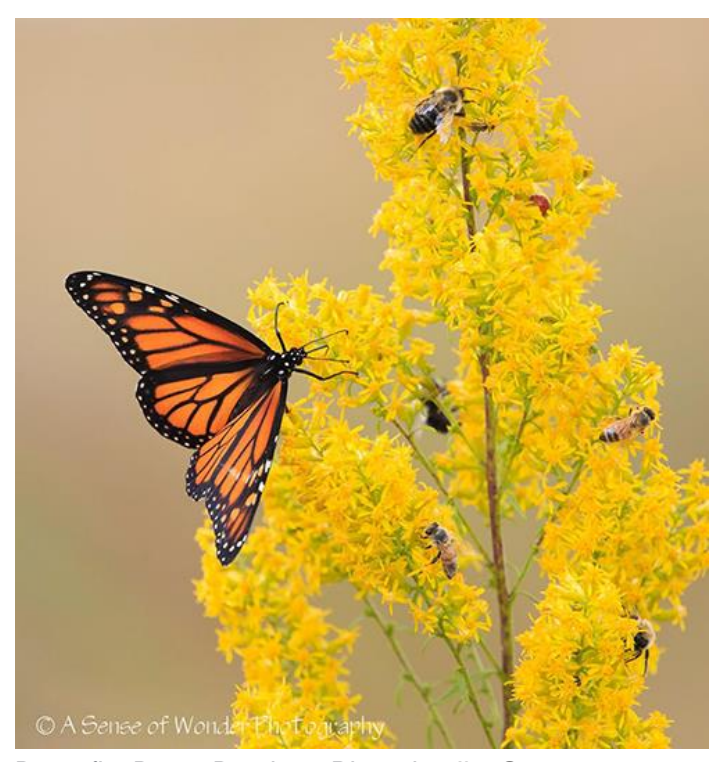
Butterfly, Bees, Beetles