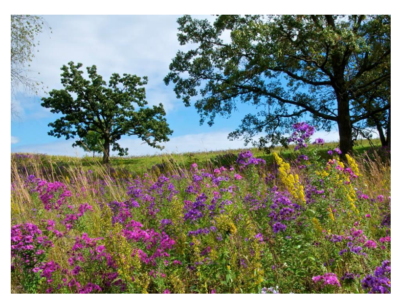
Prairie Fireworks

We welcome you to share your photos of Pope Farm Conservancy for our next "Photo of the Month." You can upload your photo(s) to our Flickr page at <a href="https://www.flickr.com/groups/fopfc-photos/">https://www.flickr.com/groups/fopfc-photos/</a> or send them to <a href="mailto:photos@popefarmconservancy.org">photos@popefarmconservancy.org</a>.