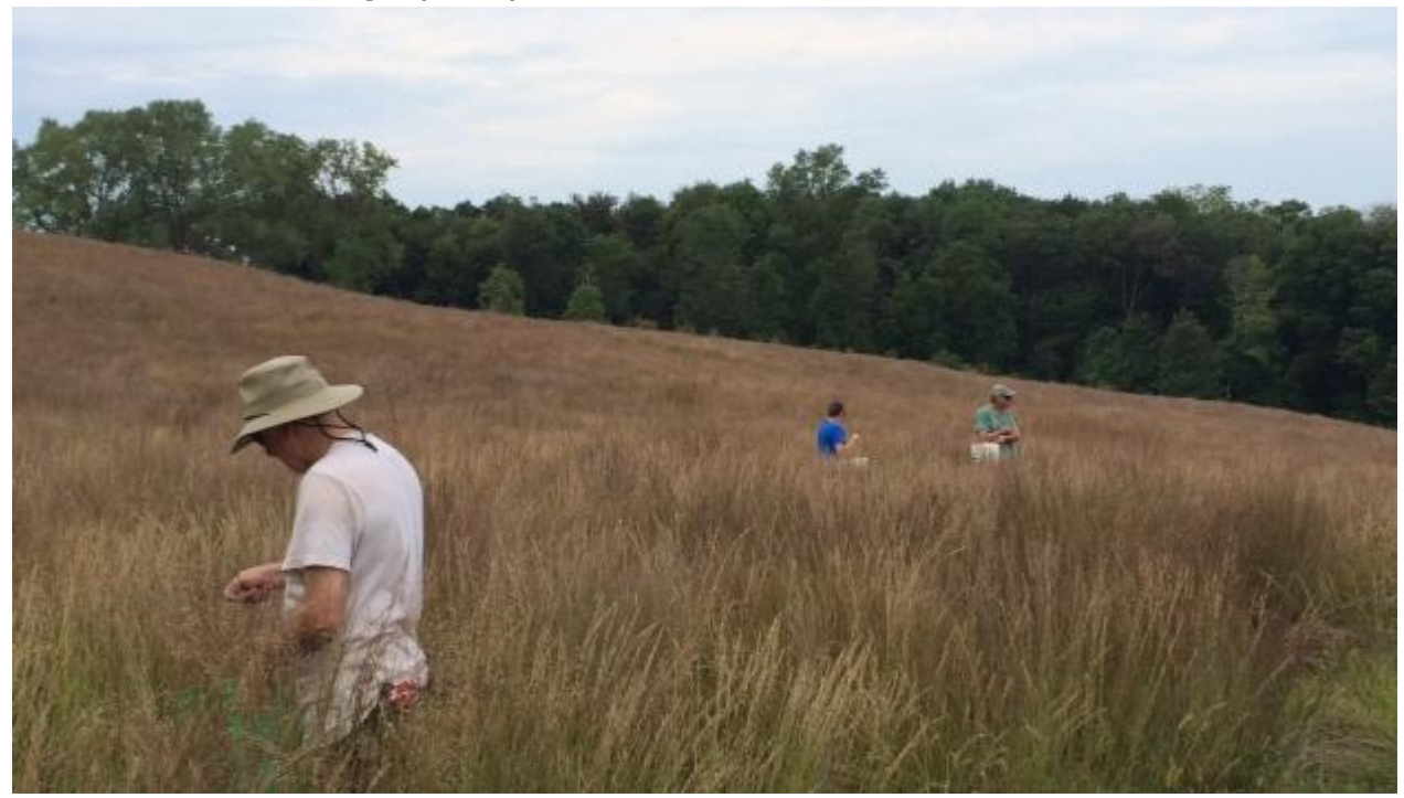
There's still time to help collect seed in the prairies at Pope Farm Conservancy!! Seed collection is easy to do, it's an enjoyable way to spend a couple hours in nature, AND it's an investment in the future. The seed that we collect will be planted in other parts of the prairie that need restoration.

Prairie Seed Collection - Sign up today!