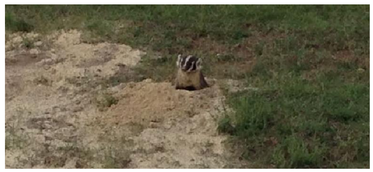
Bucky has made his home at Pope Farm Conservancy, and we are asking the "friends" to help us. If you see Bucky:

Just in time for kick off... The real Bucky the Badger