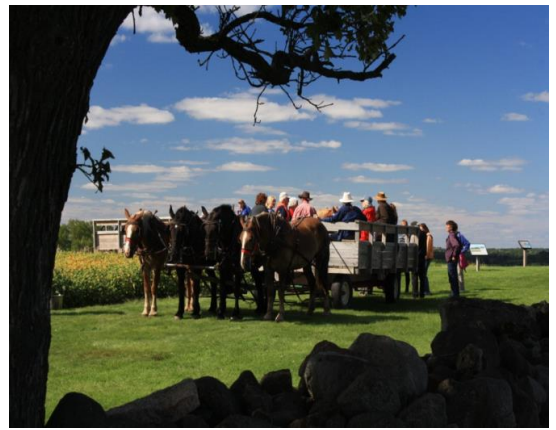
Horse drawn wagon rides from Treinen Farms were busy all afternoon with happy passengers.

A beautiful day of excitement and history!