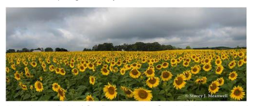
And a happy field of Sunflowers to the Goodwill Ambassadors!

Our sincere apologies to anyone else who we did not name.