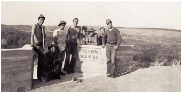
The CCC Spillway at Pope Farm Conservancy - built in 1938 by men from a camp near Mt. Horeb.

This talk is free and open to the public. No registration is necessary. We will meet in the lower parking lot by the main entrance on Old Sauk Road.