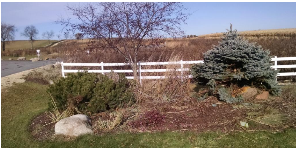
Photo of the Old Sauk Road entrance, taken November 2017