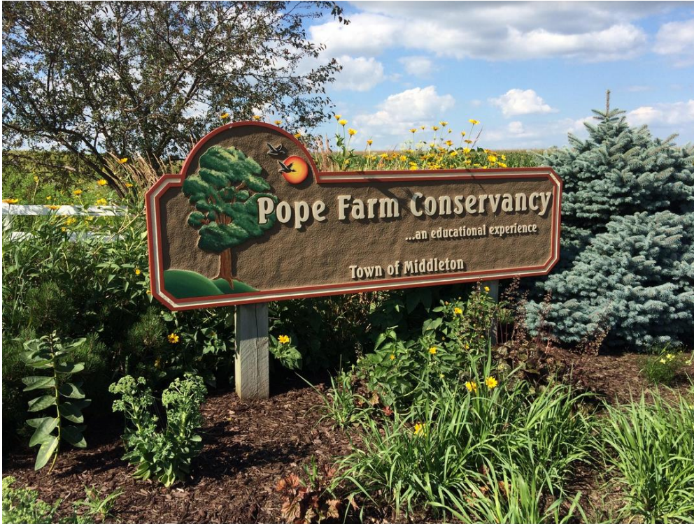
Above: Photo of Pope Farm Conservancy Sign before accident

Question: What happened to the Pope Farm Conservancy sign on Old Sauk Rd?