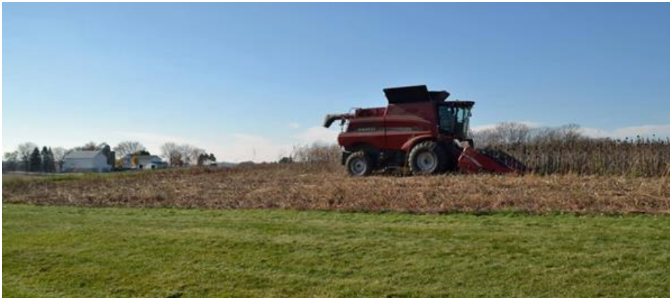
2015 Sunflower Field Harvest

The exact date to harvest the 2017 Sunflower crop has not yet been determined. It will depend on a lot of factors like the weather and moisture in the seeds. The Sunflower Field is typically harvested in early to mid-November, but we usually only have about a 24 to 48-hour notice when this occurs. When we know the exact date and time of harvest, we will post an update on our website and Facebook page. If you can make it, it's worth coming out to see! The kids will love it, too.