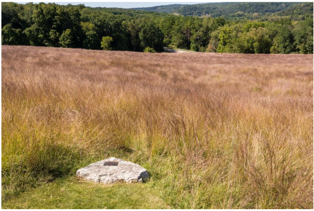
Blackhawk Prairie managed the last 3 years by FOPFC