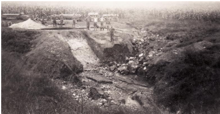
Pictured Left: CCC Spillway in 1938 (today the spillway is located at the PFC and is still functional)

The FOPFC Board approved funding for 6 new interpretive signs that would explain the story of erosion on the land. The Friends Education Team will be presenting this proposal to the Town of Middleton Parks Commission in August to seek its approval.