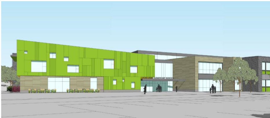
Pictured Above: Rendering of Pope Farm Elementary School (east side)

Answer: The Friends plan to develop new educational content for Pope Farm Elementary School students.