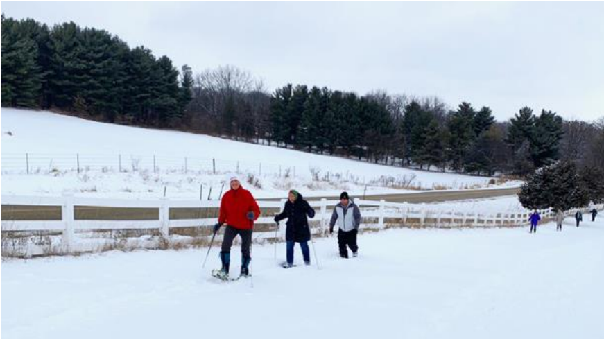
Winter Walk on Jan 18th