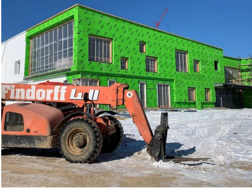
Picture above: Southeast corner of the building fully enclosed.

Crews have been hard at work on the new Pope Farm Elementary School, both inside and out. As of January 17th, the building was almost fully enclosed and the interior walls are nearly all framed out. Staircases are being completed and many of the door frames have been set. Drywall installation has already begun, and many of the large panel windows have been installed to allow lots of natural light into the building. The school is slated to open in the fall of 2020.