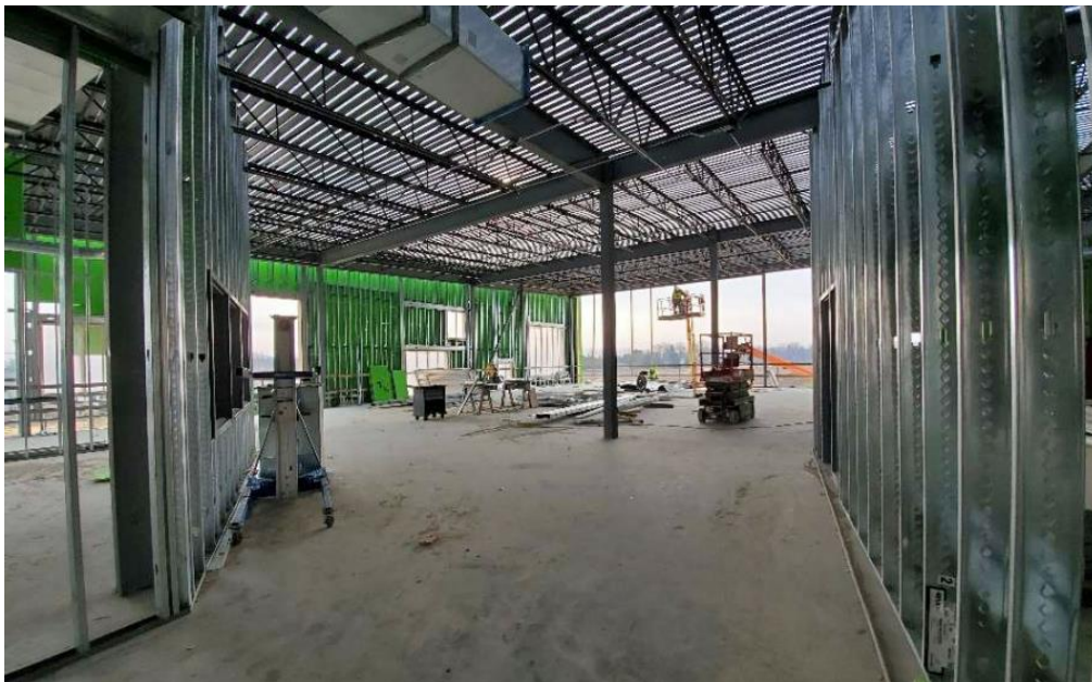
Pictured above: Progress in the LMC area. The future computer lab and makerspace will be on the right with a desk and work room on the left.

Crews have been hard at work on the new Pope Farm Elementary School, both inside and out. As of January 17th, the building was almost fully enclosed and the interior walls are nearly all framed out. Staircases are being completed and many of the door frames have been set. Drywall installation has already begun, and many of the large panel windows have been installed to allow lots of natural light into the building. The school is slated to open in the fall of 2020.