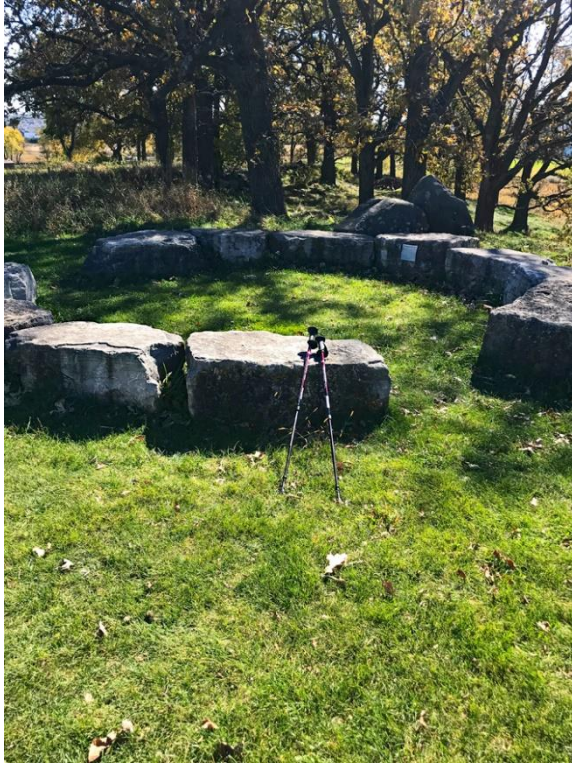
Left: Afternoon hike