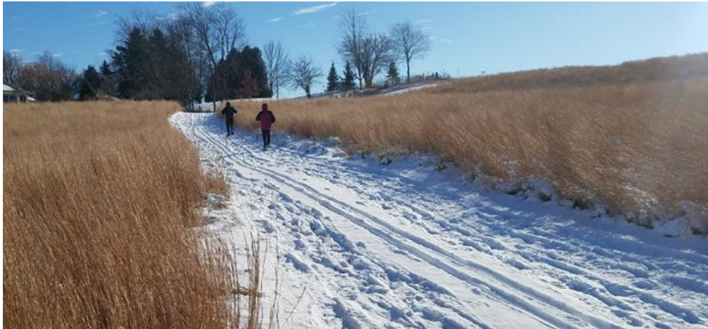
Above: Cross country skiers on the Blackhawk Prairie trails, Feb 2018

Pope Farm Conservancy is open from sunrise to sunset year-round. The Blackhawk Parking lot off Blackhawk Road is typically closed through the winter months, so we recommend parking in the lower parking area off Old Sauk Road. Once the snow flies and accumulations begin this winter, visitors are welcome to come and enjoy winter activities; snow shoeing, cross country skiing, hiking, and sledding. If the trails are groomed, please walk off to the side of the trail so it remains intact for the cross-country skiers. Thank you for your cooperation!