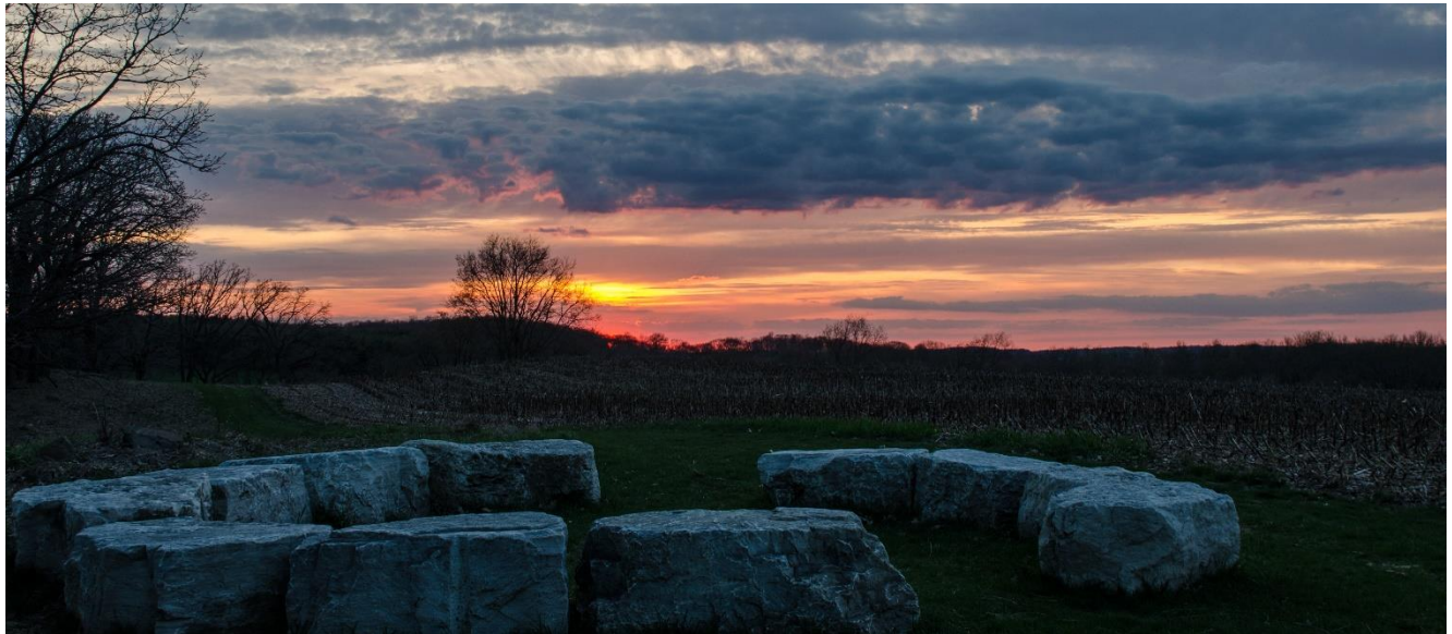
Autumn Sunset