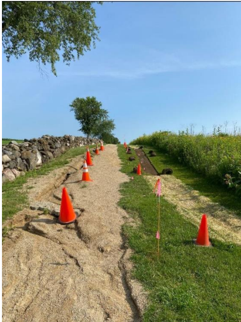
July 2020: Repairs in progress