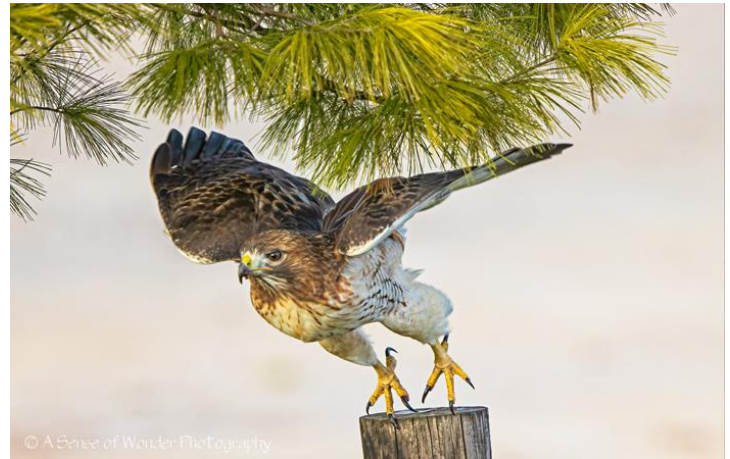
Below: Red-tailed Hawk