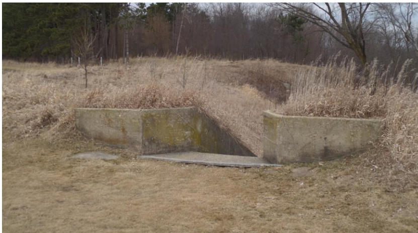
CCC Spillway at Pope Farm Conservancy Today