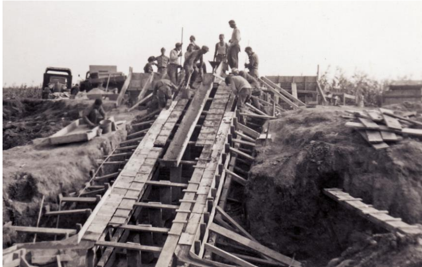
CCC Spillway under construction in 1928

Bob displayed wonderful images (below) of the CCC building the spillway that is in the Conservancy today. The spillway at the Conservancy is one of the few remaining structures built by the CCC that is currently being maintained.