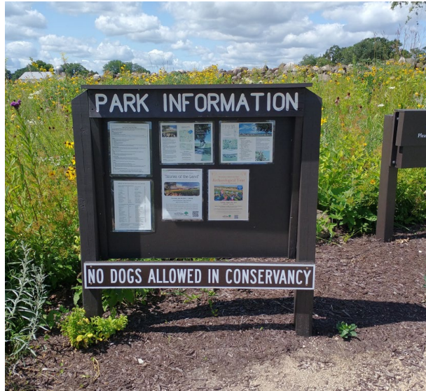
“No Dogs Allowed In Conservancy” sign replaced.