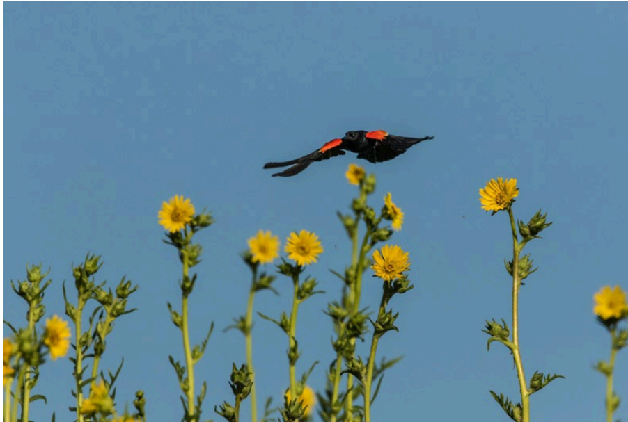
Red-winged Blackbird flying over compass plant and flashing his bright epaulets.