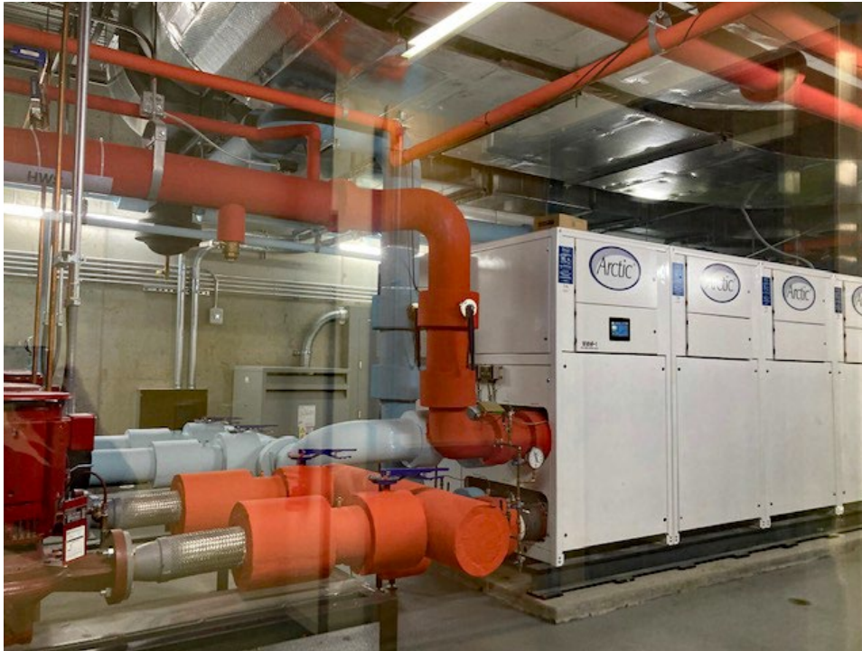
The Geothermal Room - Photo by Diane Smidt

The building supports learning in all areas and in addition it is constructed to heat and cool with geothermal equipment (pictured below) and illuminate rooms and hallways with smart lighting, thus using less energy.