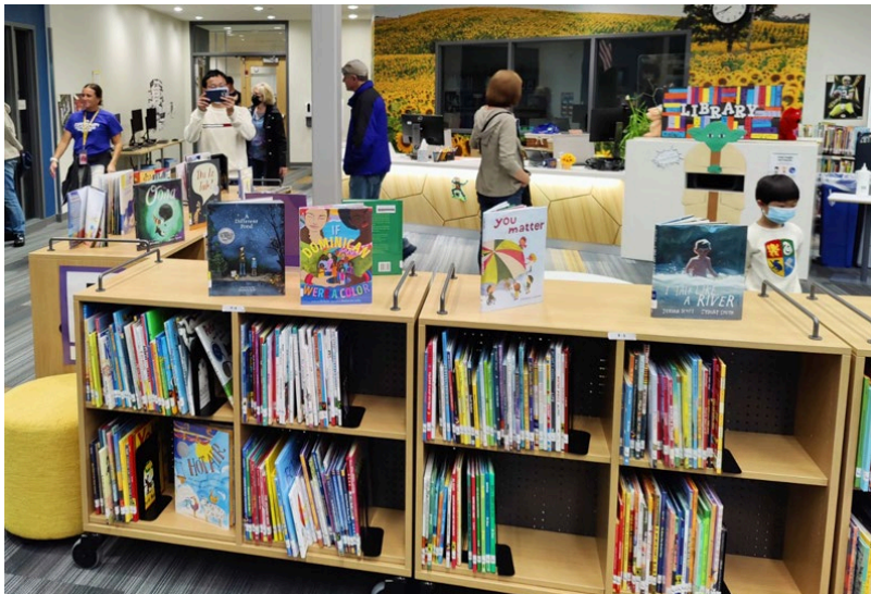
The Library

The tour included the first and second level classrooms showing the open design with moving glass walls that open classrooms to adjoining classrooms as well as to open center spaces. The classrooms have an abundance of windows that bring the outside inside. The impressive open library (pictured below) had shelving on wheels to allow quick reconfiguration of the spacious room for alternate usage. The computer room and three Maker Space rooms used for Science, Technology, Engineering and Math extension lessons encourage students to be creative while learning 21st century technology skills.