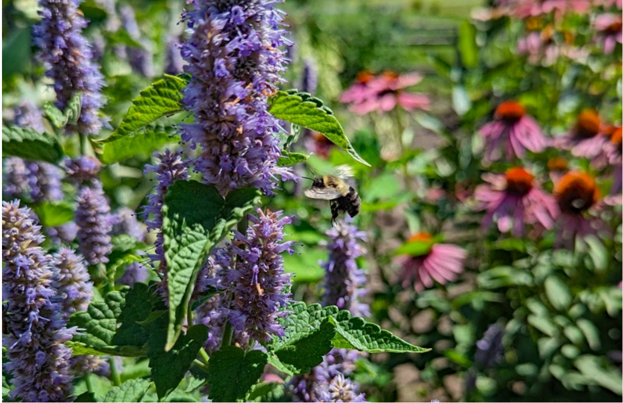
Bumblebee in Flight